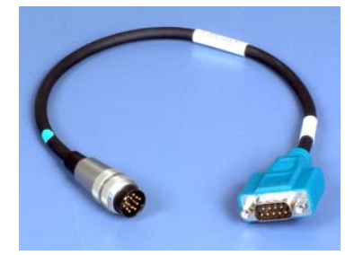
The provided RS 232-adapter cable with the marking C9900-K234 allows connecting serial peripheral devices with SUB-Dconnector to the Control Panel.