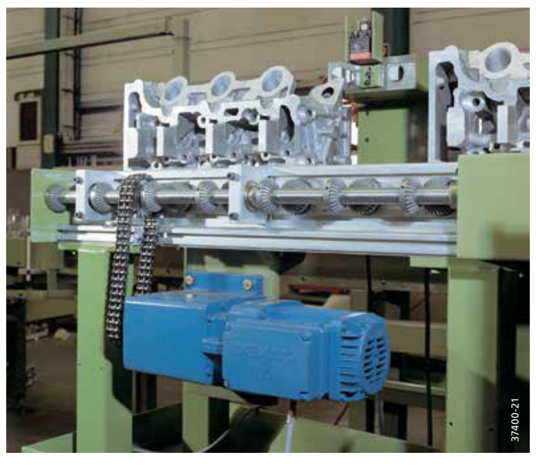
Roller conveyor operating at precisely adjusted speed