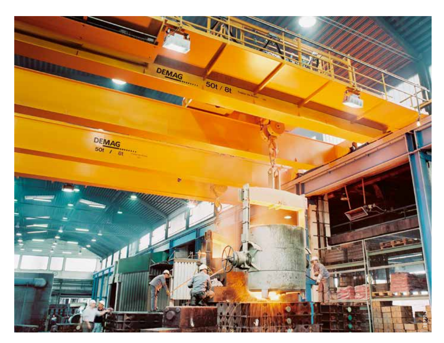
Operation in a foundry: Dedrive Compact STO offers reliable performance under even the most arduous conditions