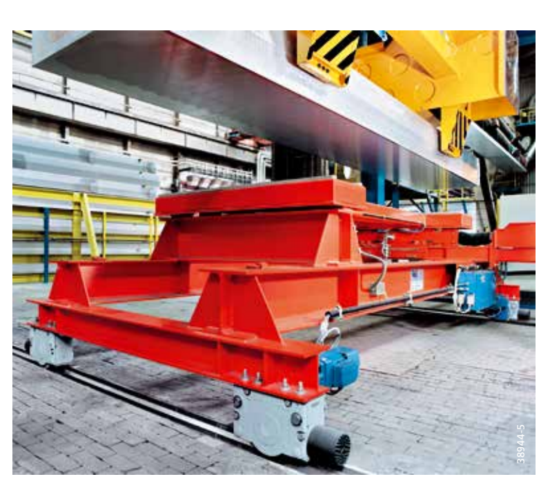
Four-wheel trolley controlled by a frequency inverter for smoothly moving blocks of aluminium

Dedrive Compact STO frequency inverters can be systematically configured to meet your needs by programming the specific parameters for the given application.