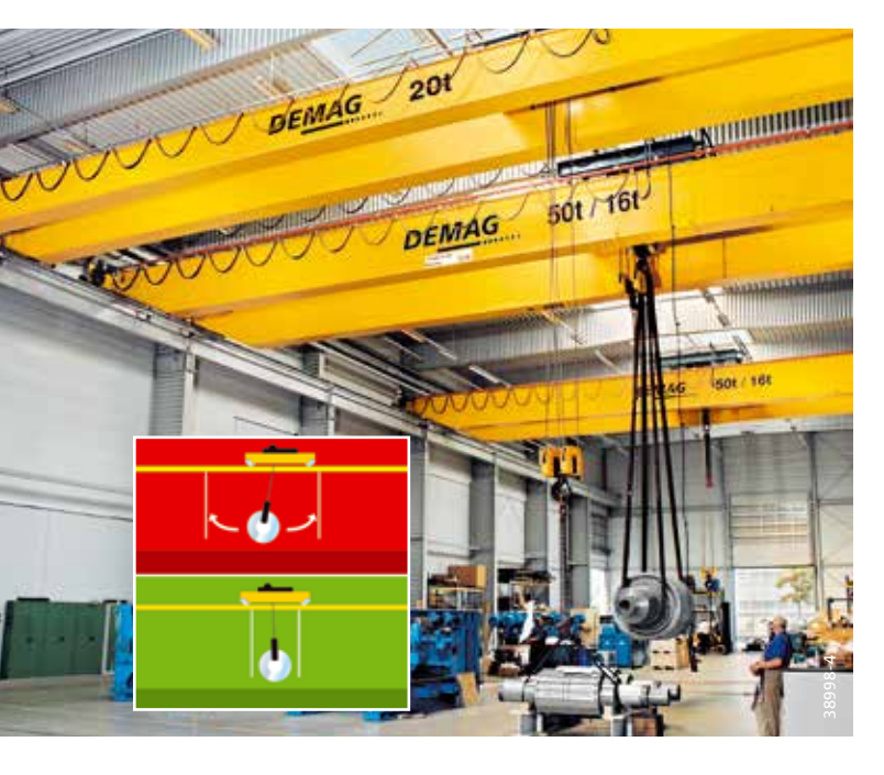
Crane loads can be positioned quickly and accurately, since load sway is virtually eliminated