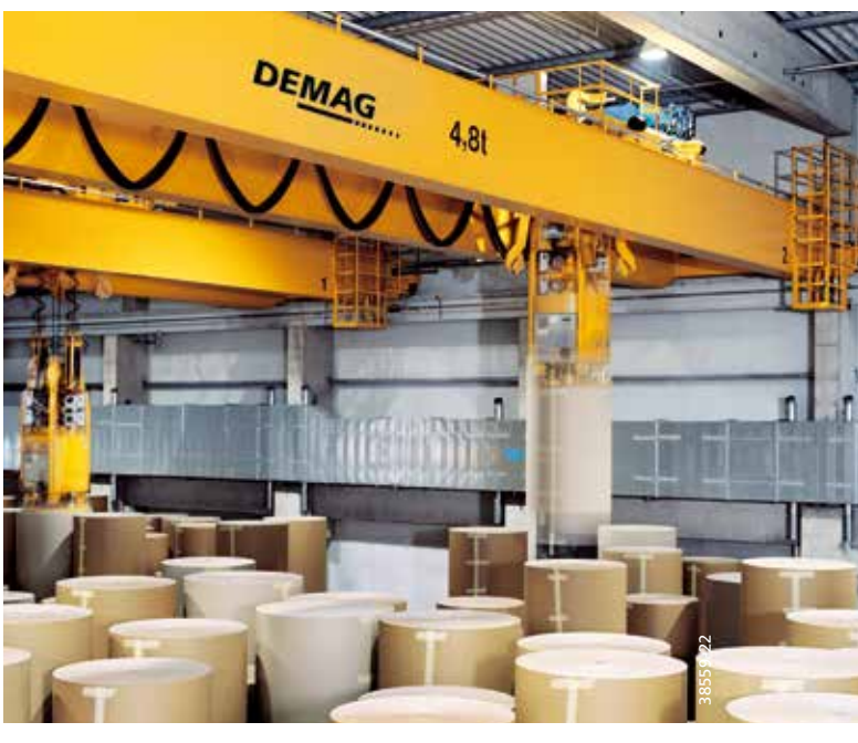
Sensitive loads can be gently picked up and precisely set down